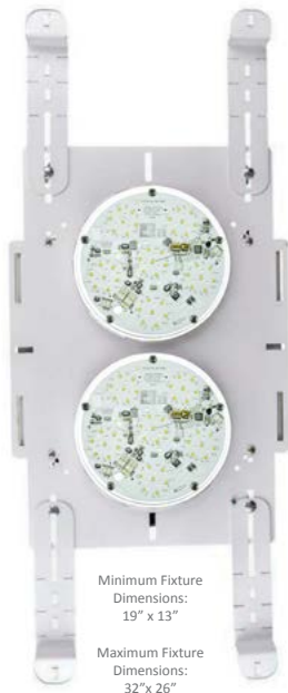
Minimum Fixture Dimensions: 19" x 13"

Universal Plates are an innovative solution that solves most retrofit issues regarding fitting and the need for a custom plate design. The universal shoe box kit comes with two Engines, driver, plate, and four adjustable arms.