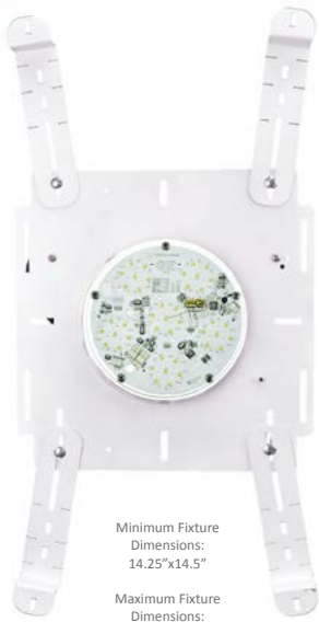
Minimum Fixture Dimensions: 14.25"x14.5"

Universal Plates are an innovative solution that solves most retrofit issues regarding fitting and the need for a custom plate design. The universal shoe box kit comes with one Engine, driver, plate, and four adjustable arms.