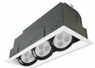
Mini AC in a 3 Lamp Combo Fixture