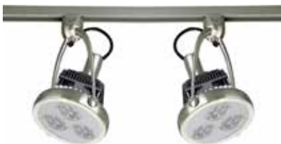
Mini AC in a Track Lighting Application